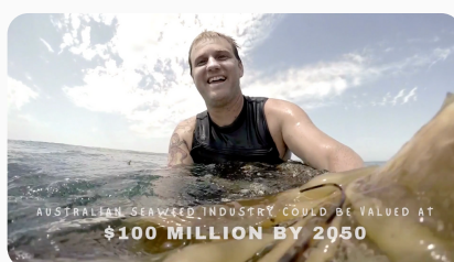
Company Introduction Video