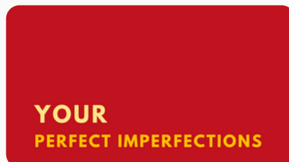
Social Media project